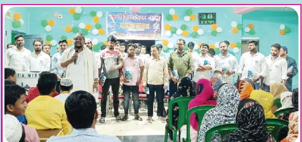
Alumni Association of Nababia Mission addressing the students at Alumni re-union