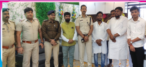
Dignitaries including Hooghly Rural Superintendent of Police Hon'ble IPS Kamanashis Sen, Hon'ble Abhishek Mondal Sir, Hon'ble Russel Parvez Sir and Hon'ble Gauranga Dey sir were present at the Mission's main office inauguration ceremony